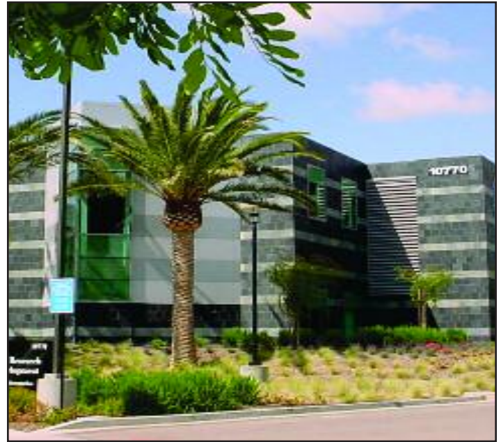
■ Figure 3. There you see it, here you don't. To comply with local ordinances governing roofline aesthetics, the mixed-flow impeller systems are mounted inside the building of this pharmaceutical manufacturer.

using methods approved by the American Society of Heating, Refrigeration, and Air Conditioning Engineers (ASHRAE) (1) or computer programs such as the EPA's SCREEN3, AERMOD or ISCST3/ISCPRIME models ( www.epa.gov ).