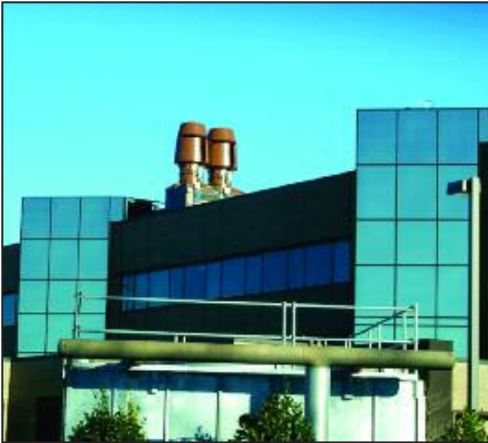
■ Figure 2. Mixed-flow impeller fans have a low profile, typically measuring about 15 ft high.